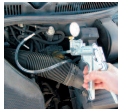
Whether dealing with pneumatic EGR valves or an electro-pneumatic pressure transducer, as in this case: The function can easily be tested using a vacuum hand pump.