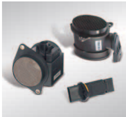
The air mass sensor is required on diesel engines, among other things for controlling the exhaust gas recirculation.