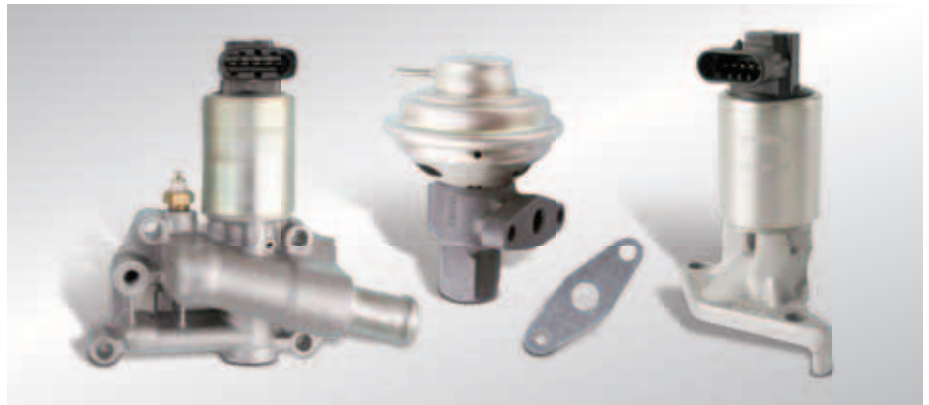
On EGR valves in petrol engines, the cross-sections are considerably smaller.