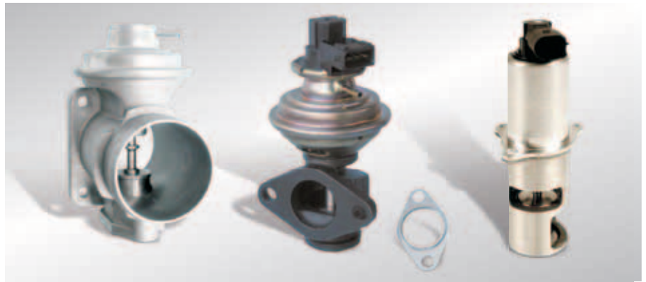
EGR valves on diesel vehicles have large opening cross-sections because of their high return rates.

Electric or electromotive EGR valves are actuated direct by the control unit and no longer need any vacuum or solenoid valve.