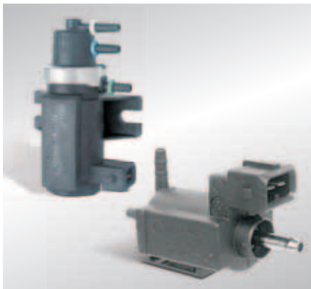
Pneumatic EGR valves are actuated with the aid of electro-pneumatic valves.