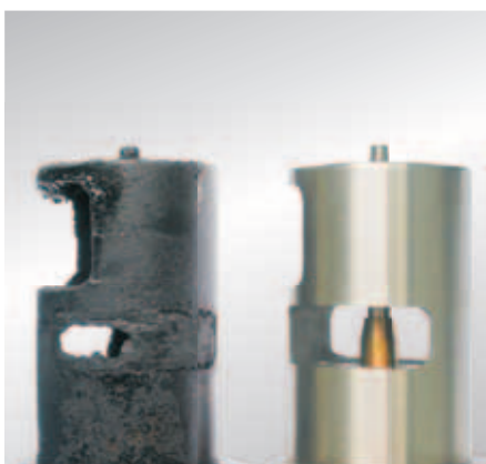
Since EGR valves do not soot themselves, it is essential to search for the causes of soot formation.

A defective component should always be replaced by a new one.