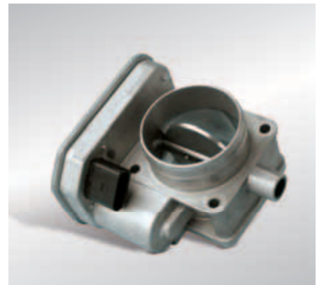
Since the pressure difference between exhaust and intake side is inadequate for the high exhaust gas recirculation rates on diesel vehicles, "regulating throttles" are fitted into the intake manifold to generate the required vacuum.