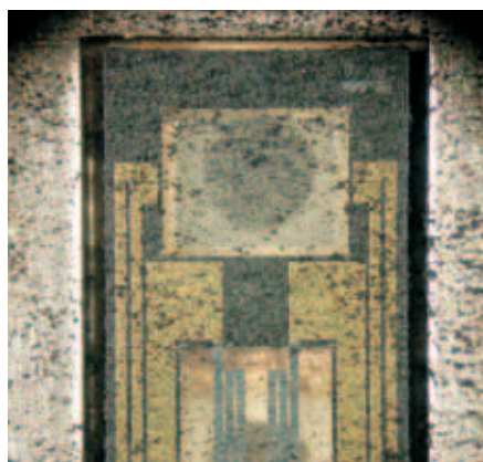
Salt and dirt may damage the sensor of an air mass sensor – they will at least falsify the measurements, which in turn could affect exhaust gas recirculation.