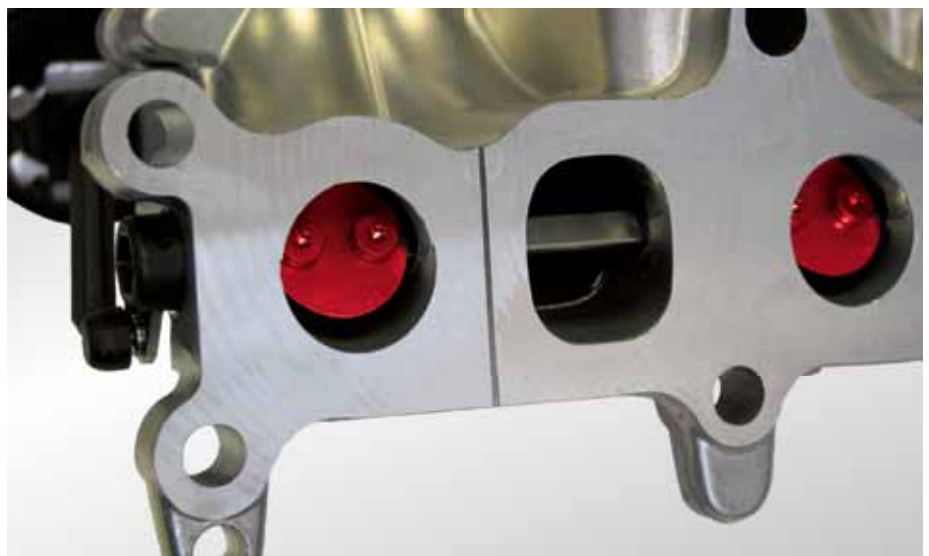
Two channels for each cylinder: Swirl flaps (highlighted in red) in the PIERBURG intake manifold, e.g. in the Opel Astra J 1.7 CDTi

The right of changes and deviating pictures is reserved. Assignment and usage, refer to the each case current catalogues, TecDoc CD respectively systems based on TecDoc.