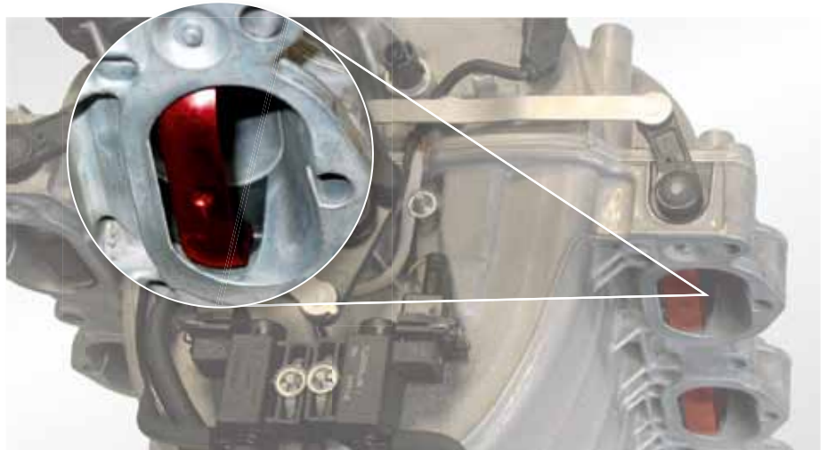
Tumble flaps (highlighted in red) in the PIERBURG intake manifold, e.g. in the Mercedes E-Class 500