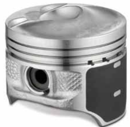
KS pistons with special piston crown for stratified charge operation

A not completely opened throttle valve in the intake air system constricts the fresh air supply. This results in resistance which causes throttle losses. Every action taken to open the throttle flap (dethrottling) reduces the throttle losses and therefore fuel consumption.