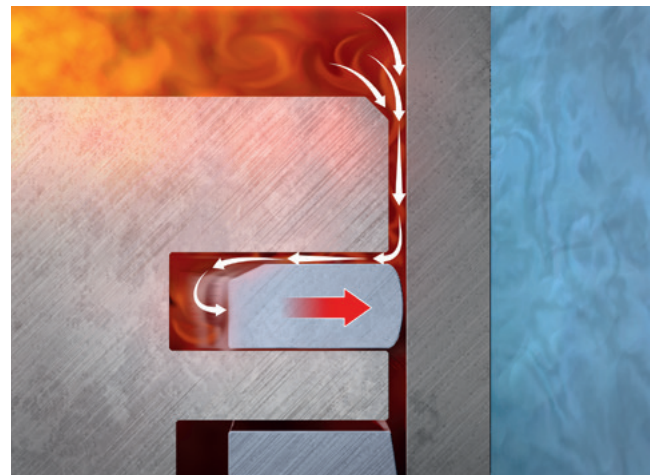
Fig. 1: Increase in pressure force due to combustion pressure

When idling and in part-load operation the combustion pressure is lower than in full-load operation. As a result, the compression rings are forced against the cylinder wall with reduced pressure. The effect of this is primarily seen in the oil scraping function of the second compression ring. In certain engines this will result in increased oil consumption.