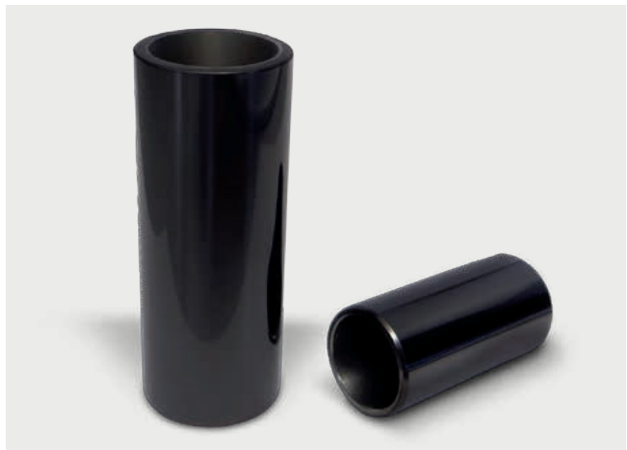
Fig. 1: Piston pin with DLC coating

DLC coatings are characterised by an extremely hard surface, which is markedly harder than that of ultra hard steels. Furthermore, DLC coatings are very elastic and can reversibly absorb deforming stresses. The layer thickness is up to 2 µm with an extremely low sliding friction coefficient of 0.1. The maximum value permissible component temperature is approx. 450 °C.