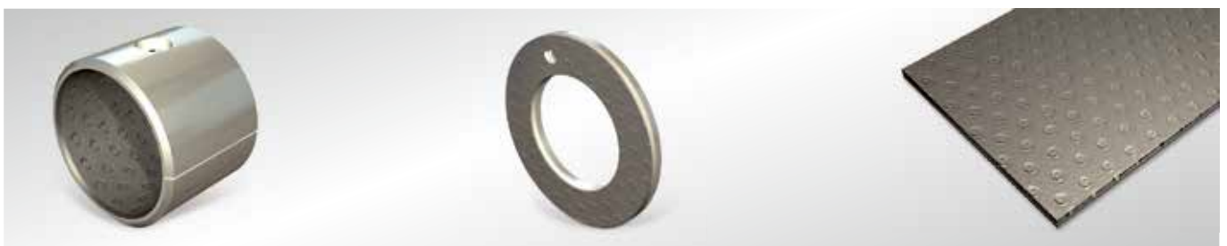
Bushes P20, P22*, P23*, P200, P202*, P203*