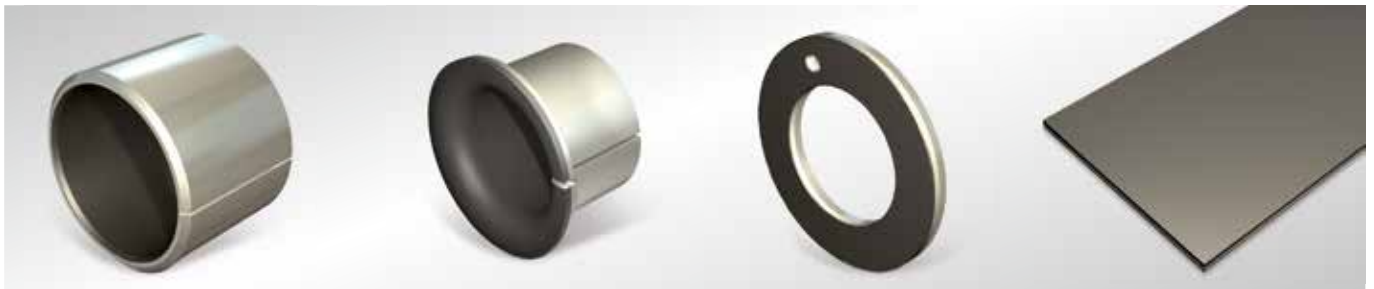
Bushes P10, P10Bz*, P14, P147*