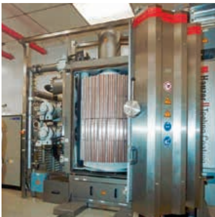
Fig. 3 Sputter plant