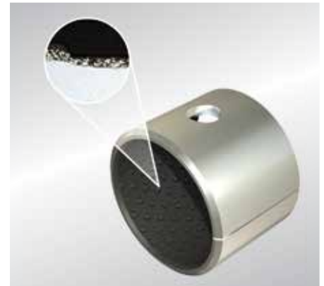
P20 plain bearing with oil distributing pockets and oil hole

The materials P20, P22 and P23 contain lead and must not be used in the food sector.