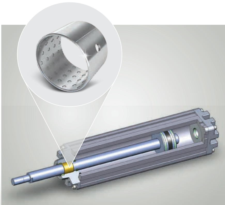
Pneumatic cylinder application, bearing with KS PERMAGLIDE® P20 plain bearings