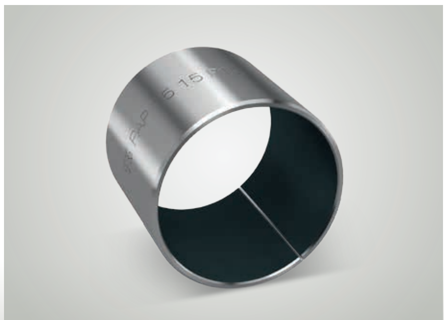
KS PERMAGLIDE® P10 plain bearing bush