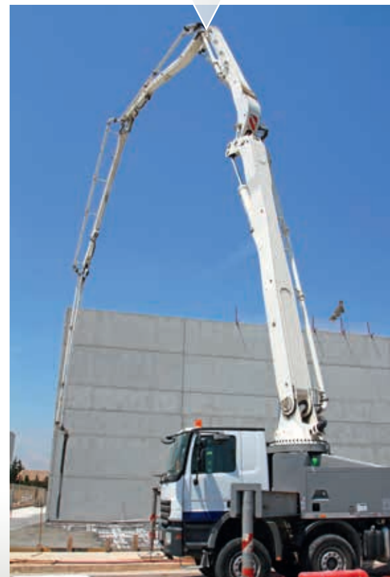
Concrete placing boom