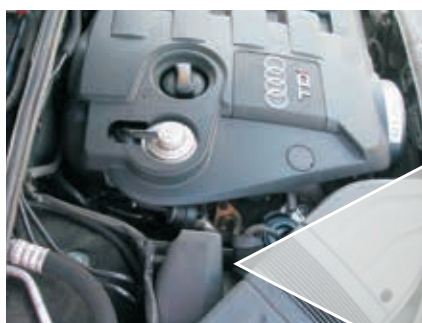
Fig.: VTG charger and EPW (highlighted in red) in the Audi A4 TDI