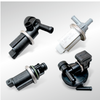
Fig. 19: different valves (AKF-system)

For the tank leakage diagnosis, in addition to the components of the tank ventilation system (see Section 4.2), a canister purge shut-off valve and, depending on the test procedure, either a fuel tank pressure sensor or a diagnostic pump are necessary.