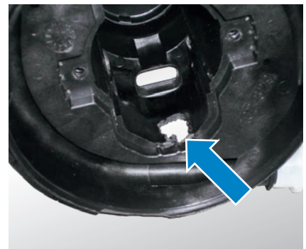
Damage symptoms: Melting traces on the housing (top view into the housing)