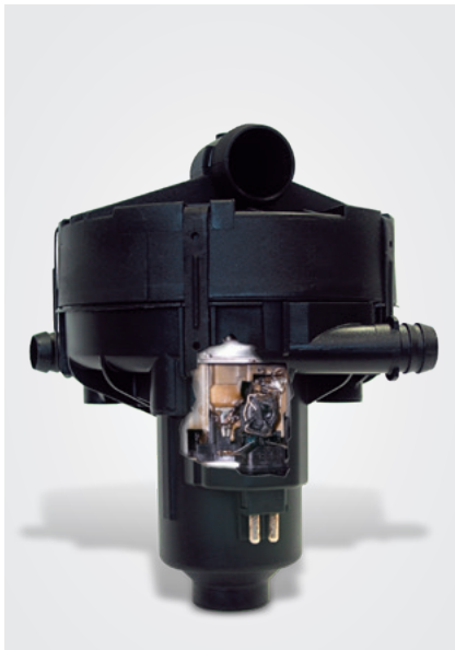
View into the secondary air pump (cut) with melting traces